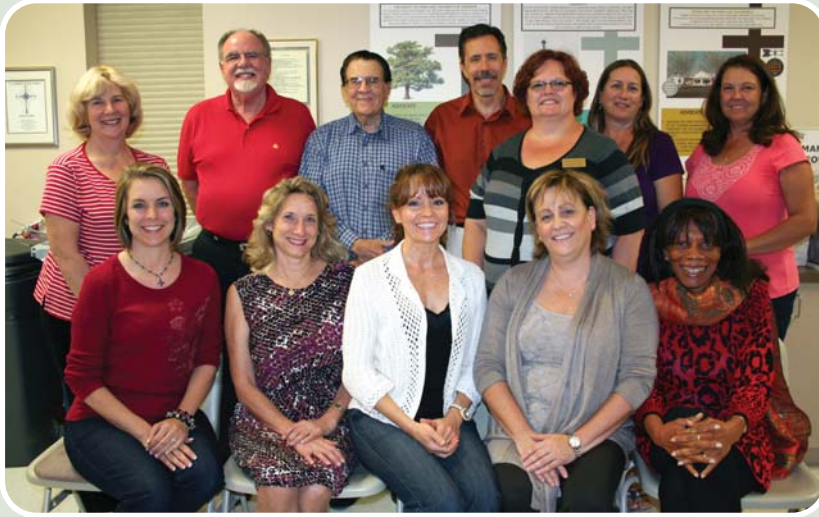
St. Laurence Social Concerns Ministry Board